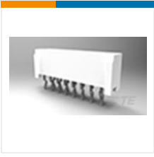
1.25MM FFC POST PLATED V 26P 2-84534-6