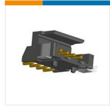
CT BOX HDR H SMT 3P O/TAPE NAT 1-292173-3