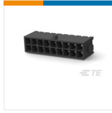
18P MICRO MNL ASSY, VRT, HDR, LF 4-794630-8